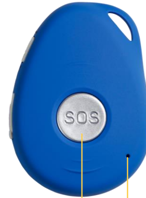
SOS button microphone

To trigger the SOS Alarm press and hold the SOS button for 3 to 4 seconds